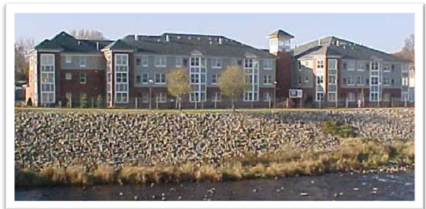
River’s Edge, Rochester